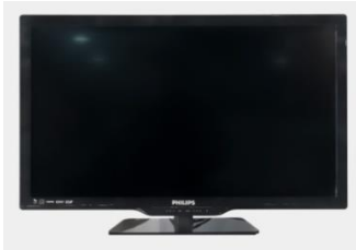
32" Flat Screen