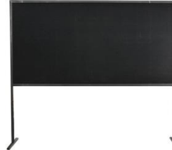
Horizontal Display Board