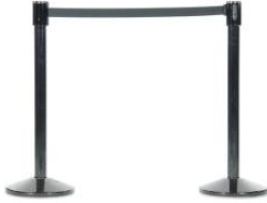
Stanchion with 7" Strap