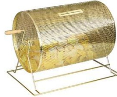
Small Brass Draw Barrel