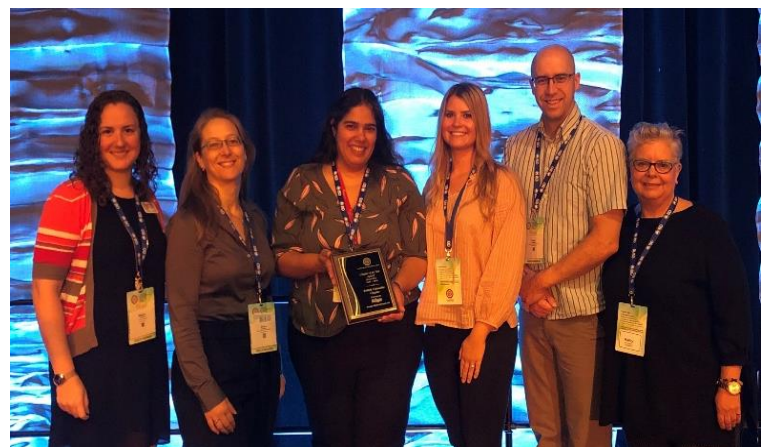
British Columbia Chapter Chapter of the Year – 2 nd Place